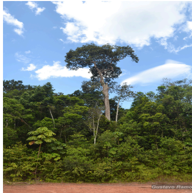
Figure 1: Aldina kunhardtiana R.S.Cowan