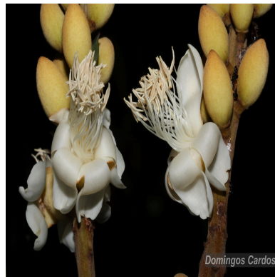
Figure 4: Aldina discolor Spruce ex Benth.