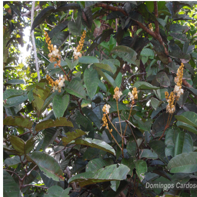
Figure 1: Aldina discolor Spruce ex Benth.