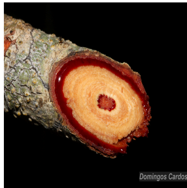
Figure 6: Aldina latifolia Spruce ex Beth.