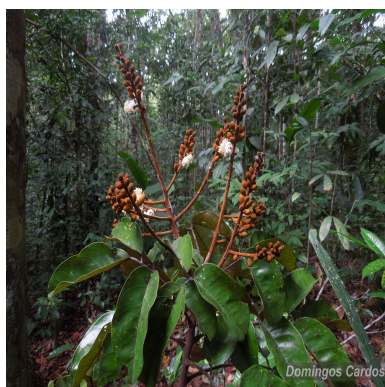
Figure 3: Aldina kunhardtiana R.S.Cowan