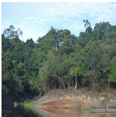
Figure 1: Aldina latifolia Spruce ex Beth.