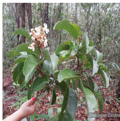
Figure 3: Aldina heterophylla Spruce ex Benth.