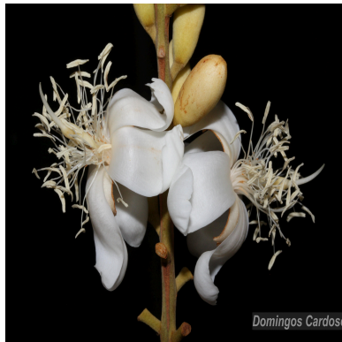
Figure 4: Aldina latifolia Spruce ex Beth.