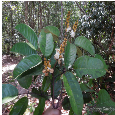
Figure 2: Aldina discolor Spruce ex Benth.