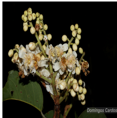
Figure 1: Aldina heterophylla Spruce ex Benth.