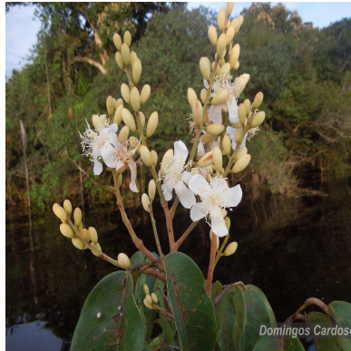
Figure 3: Aldina latifolia Spruce ex Beth.