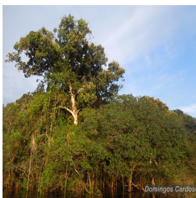
Figure 2: Aldina latifolia Spruce ex Beth.