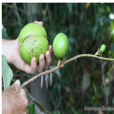
Figure 5: Aldina latifolia Spruce ex Beth.