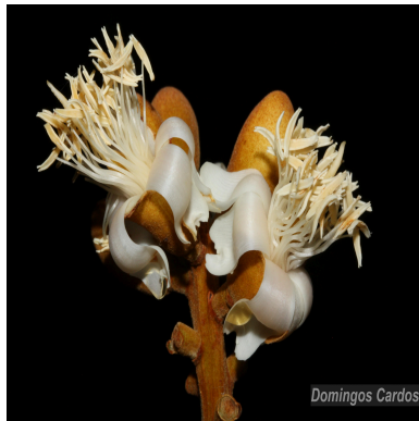
Figure 2: Aldina kunhardtiana R.S.Cowan