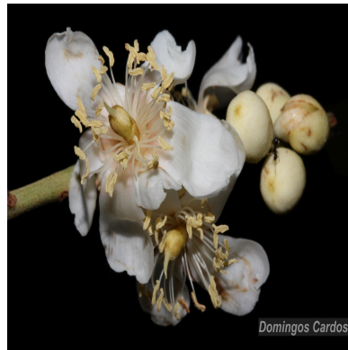
Figure 2: Aldina heterophylla Spruce ex Benth.