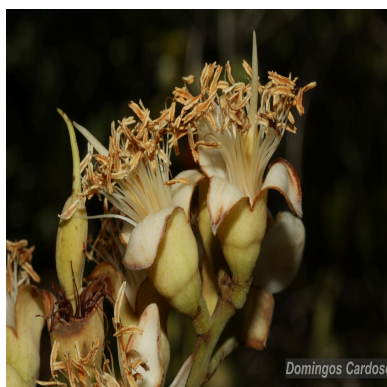
Figure 3: Aldina discolor Spruce ex Benth.